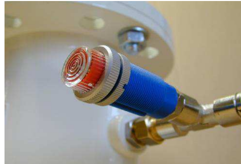
pinch valve under pressure (closed)