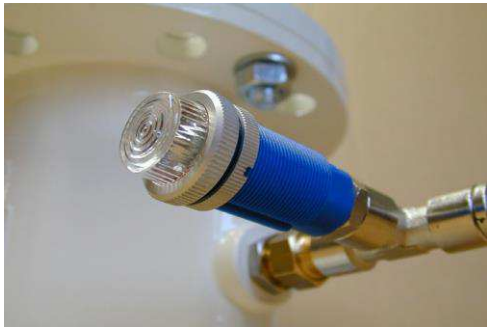
pinch valve no pressure (open)

This unit is suited for monitoring and indicating operating conditions of AKO pinch valves. When the control pressure exceeds 1.5 bar (22psi) to close the pinch valve, the visual pressure indicator will activate. When activated, a red signal will turn on (easily seen).